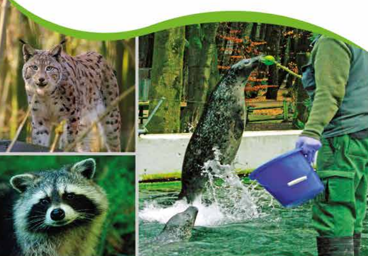
Animal birthday fun for kids